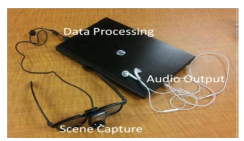
Fig.3. Snapshot demo system including three functional Components for Scene capture, data processing, and audio output.